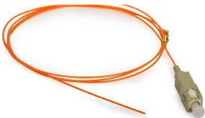
Fiber Multimode PigTail