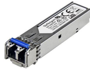
Multimode SFP Module