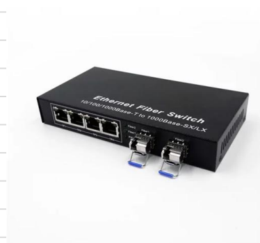
SFP Switch 4 port, POE